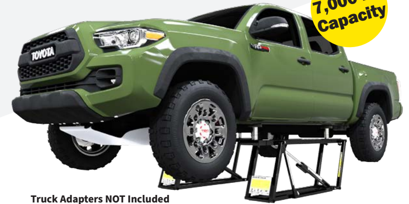
7000TL Ideal for Truck & SUVs