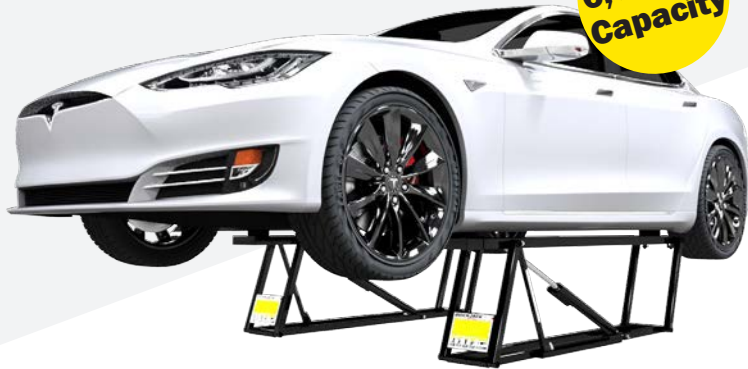
6000ELX Extra-Long Wheelbases