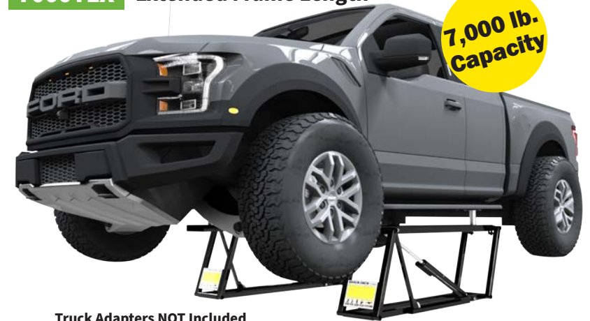
7000TLX Extended Frame Length