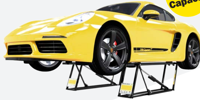
5000TL Most Popular Model