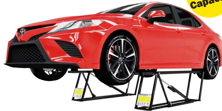
5000TLX Extended Frame Length